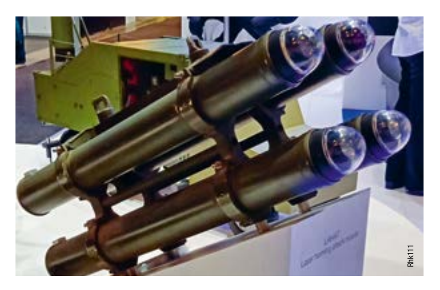
The Laser Homing Attack Missile or LAHAT produced by Israel Aerospace Industries on display at the 2018 Asian Defence and Security trade show.

In the figure above, the box in the top right represents the clear-cut situation in the first example, where circumstances would not allow respect for IHL; and the box in the bottom left represents the situation in the second example, where the use of explosive weapons would not be likely to cause indiscriminate effects. This assessment is also influenced by the size of the military objective, represented by the triangle: the smaller the specific military objective, the greater the likelihood of indiscriminate effects from the use of heavy explosive weapons.