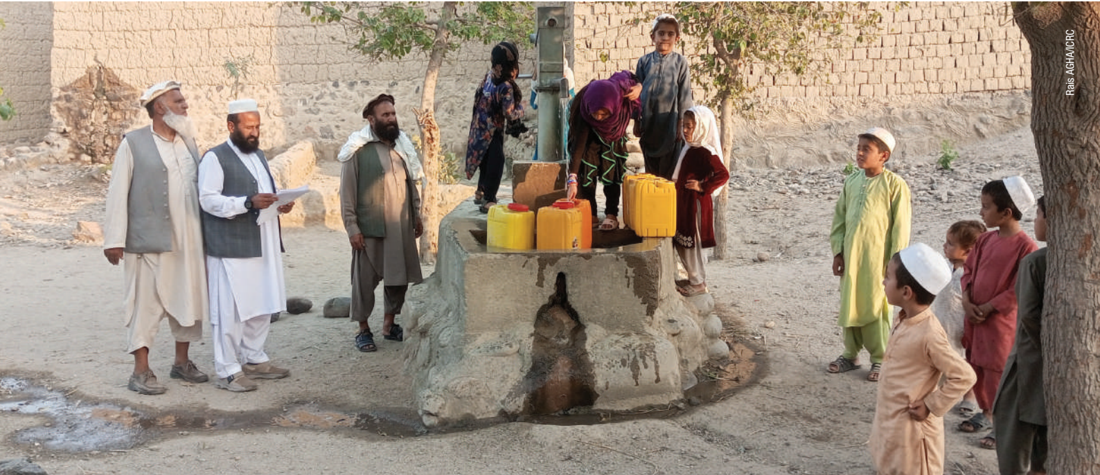
People collect water from repaired handpumps in Laghman's provincial Alinigar district.

7 morgue freezers, 2 morgues and 1 container were repaired to improve the storage capacity of the morgues in MLD