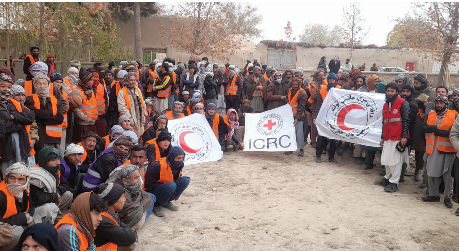
Cash for work project supported by the ICRC in Yangi Qala district of Takhar.

6 security assessments of the regional offices and branches were conducted by ARCS safety and security staff