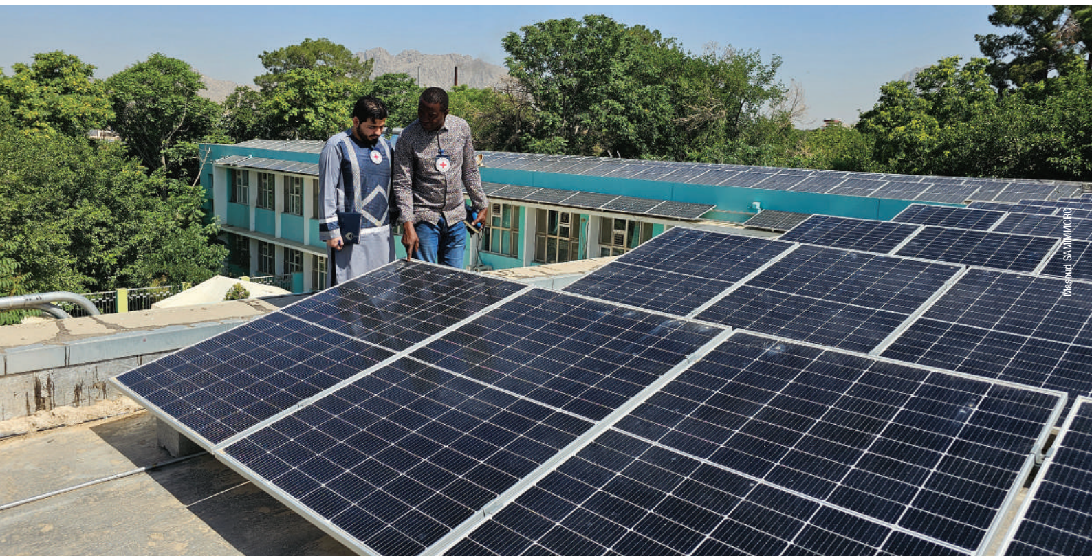
ICRC helping to improve the electricity supply to the Mirwais Regional Hospital

1,175 religious and community leaders and members, and ICRC contacts attended 34 Iftar gatherings held in various ICRC offices across the country during the month of Ramadan