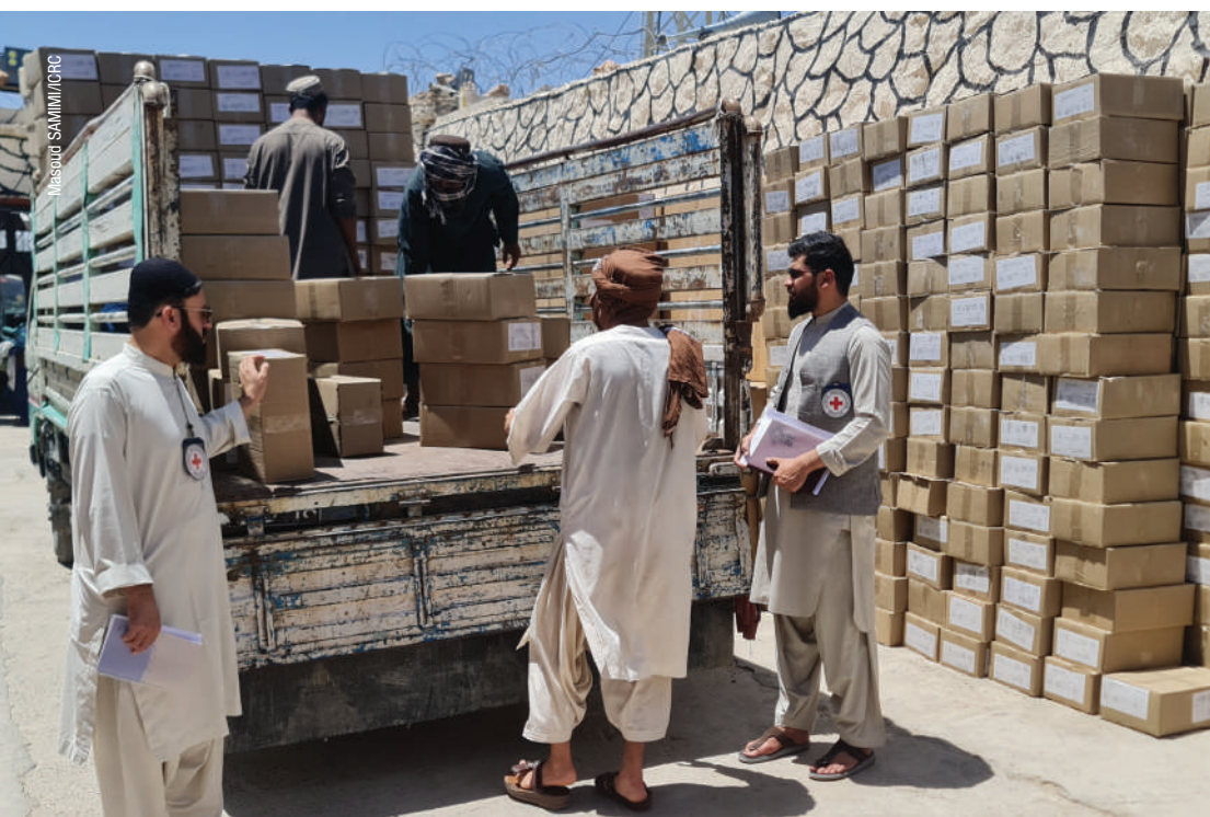
Hygiene items distribution in Sarpoza provincial prison.

About 30 female detainees in Sarpoza provincial prison were provided with sewing and tailoring training at the prison's restored sewing workshop