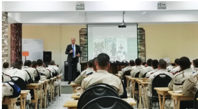
An ICRC dissemination session on IHL conducted in collaboration with the Egyptian Armed Forces.

The ICRC works globally to promote International Humanitarian Law (IHL) to protect people affected by armed conflicts and violence. In Egypt, it raises awareness of IHL at the national and regional levels by engaging with the armed and security forces, judges, media, academics, and key institutions like the League of Arab States and Al-Azhar. In 2024, the ICRC focused on the following: