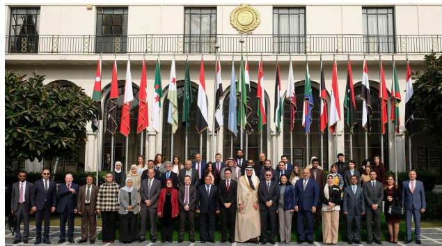
Group photo from the first LAS-ICRC meeting on IHL and new technologies, held at the LAS headquarters in Cairo.