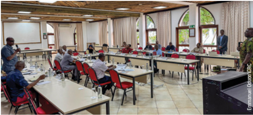
A Commanders Workshop on International Human Rights Law/ International Standards for Policing held in Mombasa.