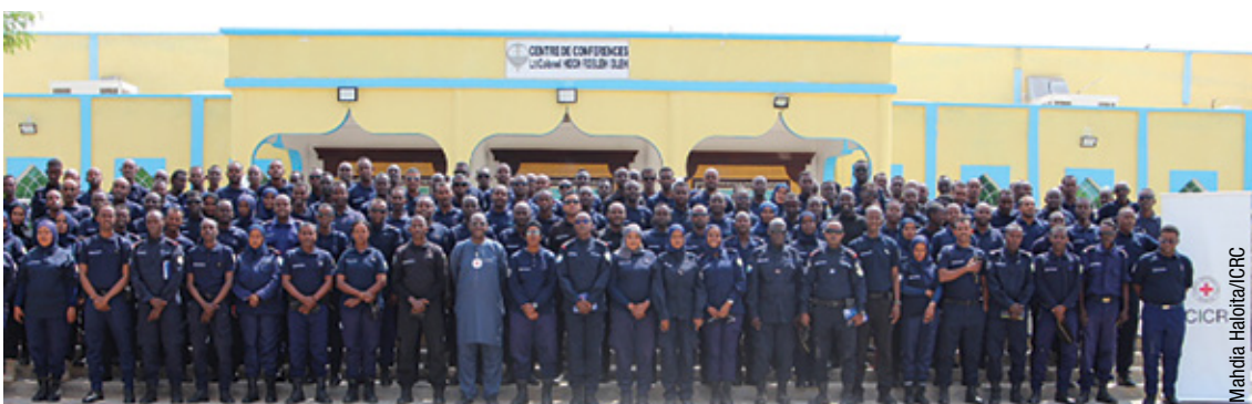
Gendarmerie were sensitized on IHL & IHRL before proceeding for a UN peace keeping mission.