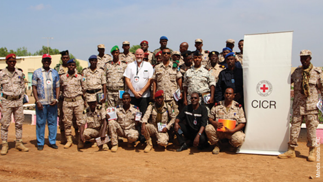
Djiboutian military forces pose for a photo with ICRC staff after an IHL refresher course