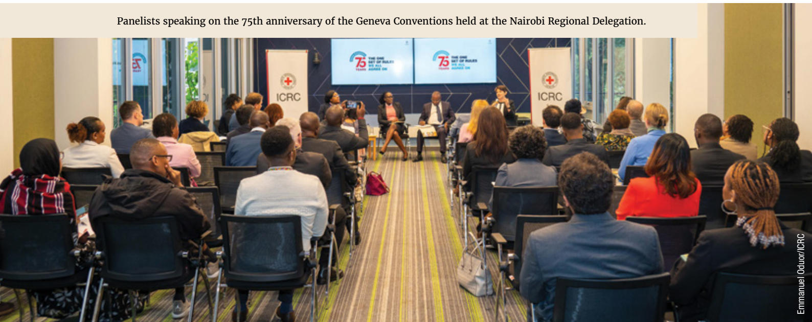
Panelists speaking on the 75th anniversary of the Geneva Conventions held at the Nairobi Regional Delegation.