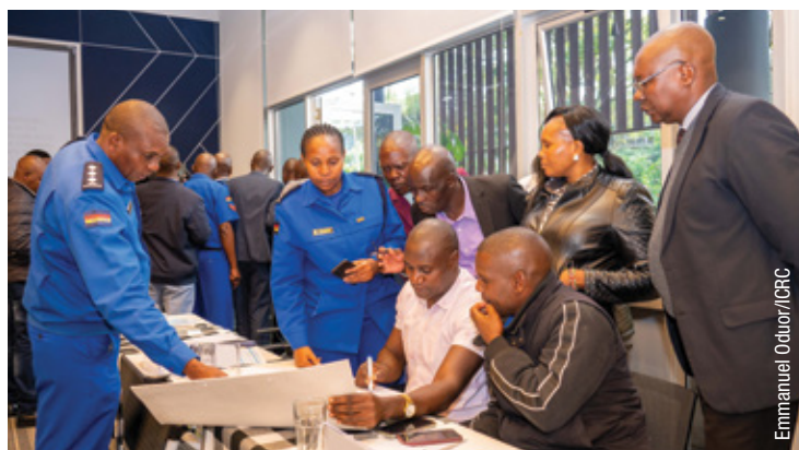
A Training of Trainers program was held in Nairobi aimed at equipping the Kenya Police Services on human rights integration during their operations.