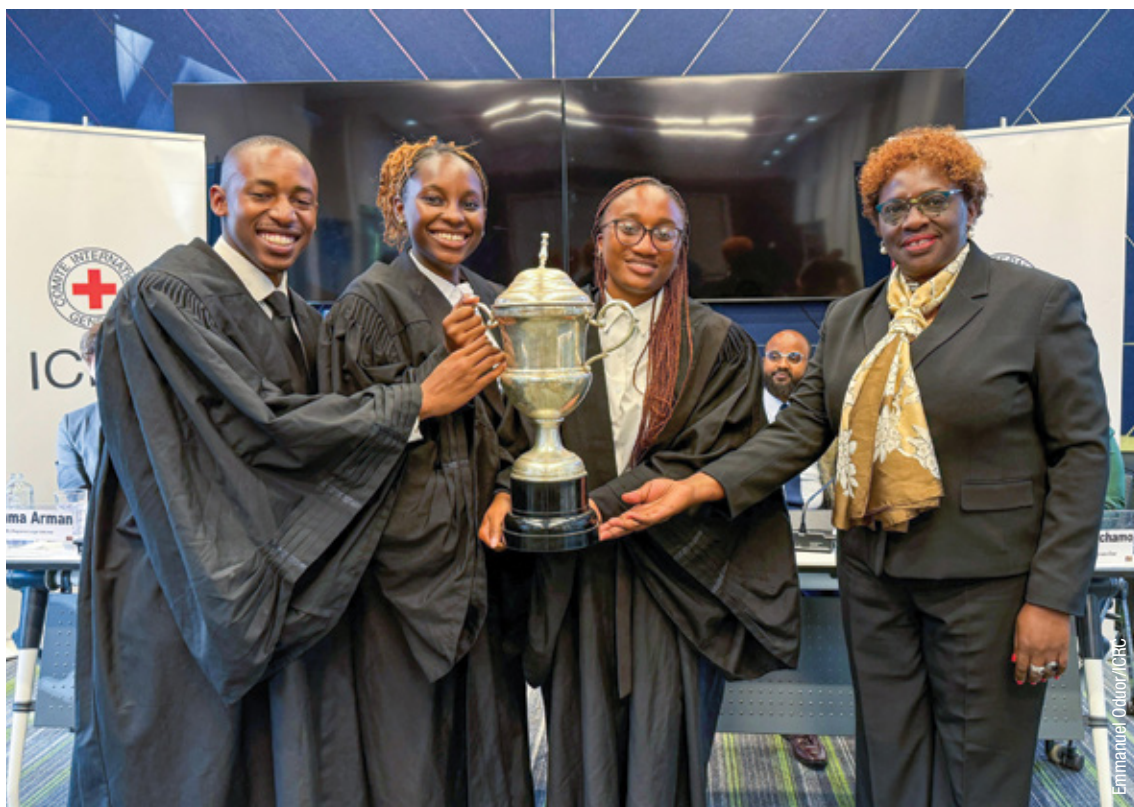
Students from Zimbabwe University receiving their trophy after emerging as the All Africa 2024 winners.