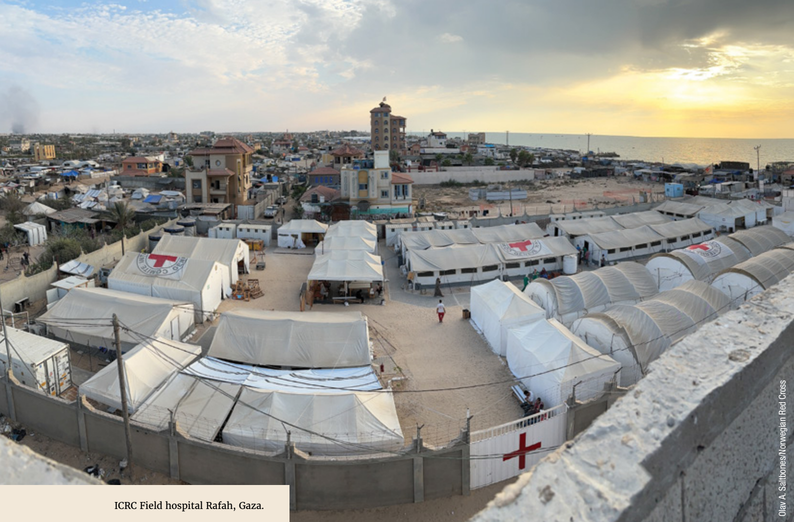
ICRC Field hospital Rafah, Gaza.