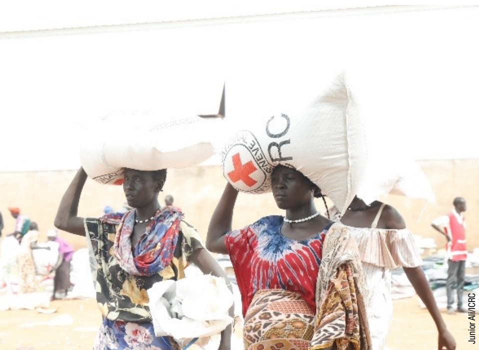
Women carrying home their rations during a distribution of food and essential household items to South Sudanese returnees in Gok-machar, Northern Bahr el Ghazal.