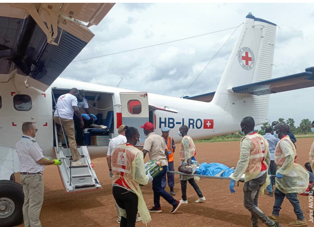
South Sudan Red Cross volunteers in Yei help board a weapon-wounded patient onto an ICRC airplane for evacuation to Juba for treatment.