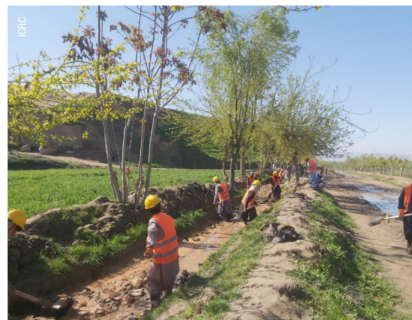
Community workers in Zakhil, Kunduz, restoring irrigation canals and building culverts, enhancing water access for around 5,000 households.

300 households (2,400 people) received the final round of cash assistance as part of a project to support pregnant and lactating women in Mazar-i-Sharif.