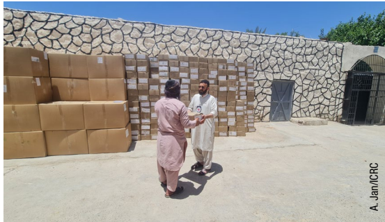
Hygiene distribution in Sarpoza detention in Kandahar.

More than 2,000 detainees in Sarpoza Provincial Prison benefited through improved water supply systems.