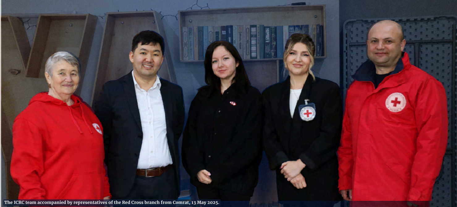
The ICRC team accompanied by representatives of the Red Cross branch from Comrat, 13 May 2025.