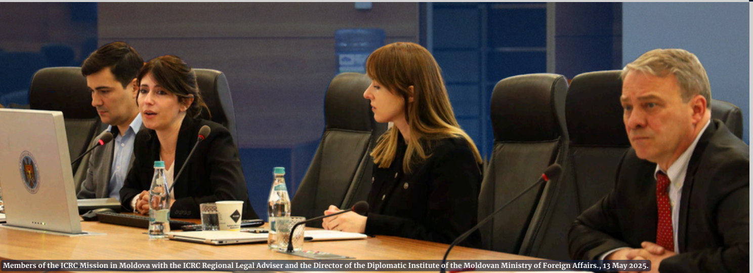
Members of the ICRC Mission in Moldova with the ICRC Regional Legal Adviser and the Director of the Diplomatic Institute of the Moldovan Ministry of Foreign Affairs., 13 May 2025.