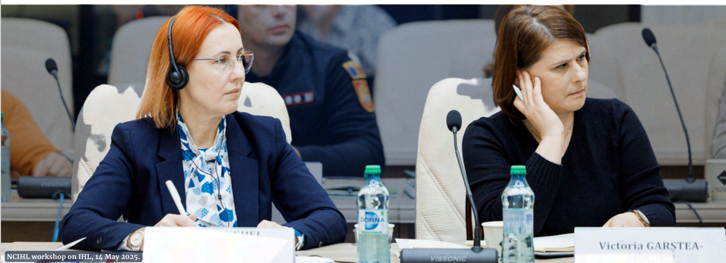
NCIHL workshop on IHL, 14 May 2025.

Building on this workshop, the ICRC also facilitated the participation of two NCIHL representatives in the 2nd Regional Conference of European IHL Committees, held in Warsaw on 20–21 May. The conference continued discussions under the Global IHL Initiative, which seeks to place IHL high on the political agenda at national, regional and global levels.