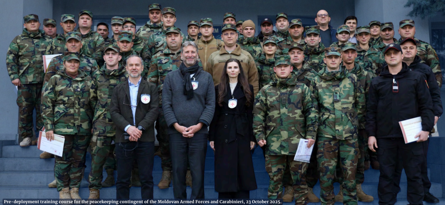
Pre-deployment training course for the peacekeeping contingent of the Moldovan Armed Forces and Carabinieri, 23 October 2025.