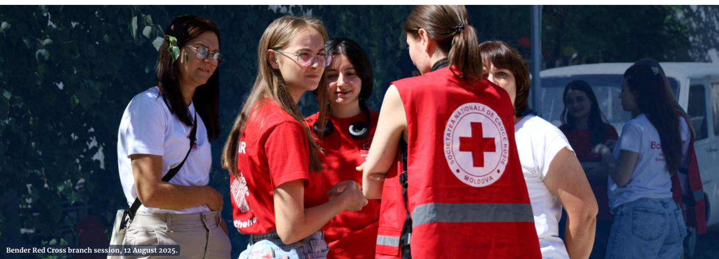
Bender Red Cross branch session, 12 August 2025.

The ICRC sustained its technical and financial support to the MRCS to enhance family tracing and reunification services. Besides, together with the MRCS' Bender, Grigoriopol and Ribnitsa branches, the ICRC continued assisting the most vulnerable cases among Ukrainian refugees to cover their essential and urgent needs.