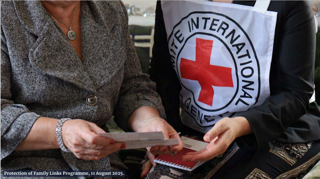
Protection of Family Links Programme, 11 August 2025.