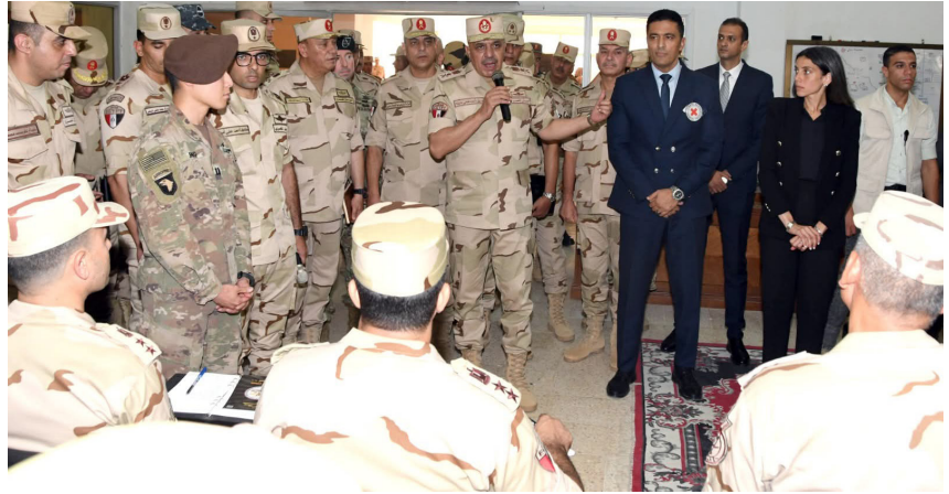
Part of the ICRC's participation in the multinational military exercise Bright Star 2025.

6 members of the ENCIHL enhanced their knowledge of the ICRC and IHL through participation in the annual Regional Arabic course on IHL.