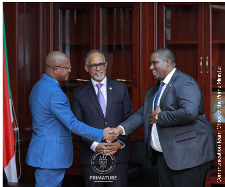
Communication Team, Office of the Prime Minister