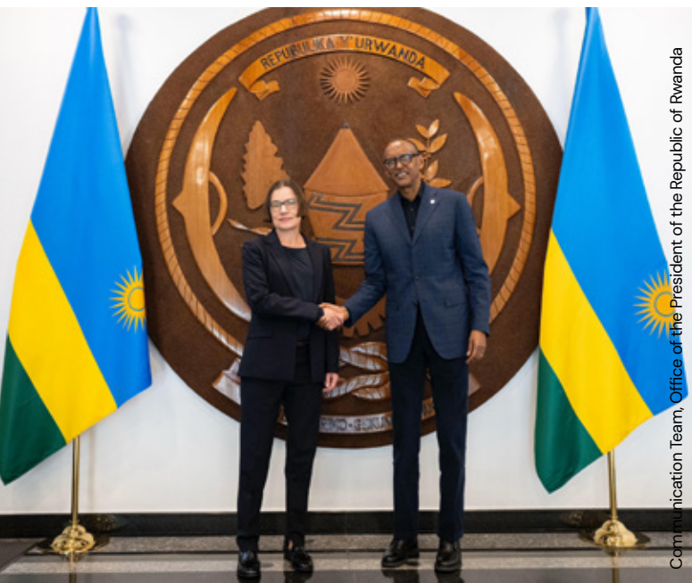
Communication Team, Office of the President of the Republic of Rwanda

ICRC President Mirjana Spoljaric Egger with His Excellency Paul Kagame, President of the Republic of Rwanda during her visit to Rwanda in 2005.