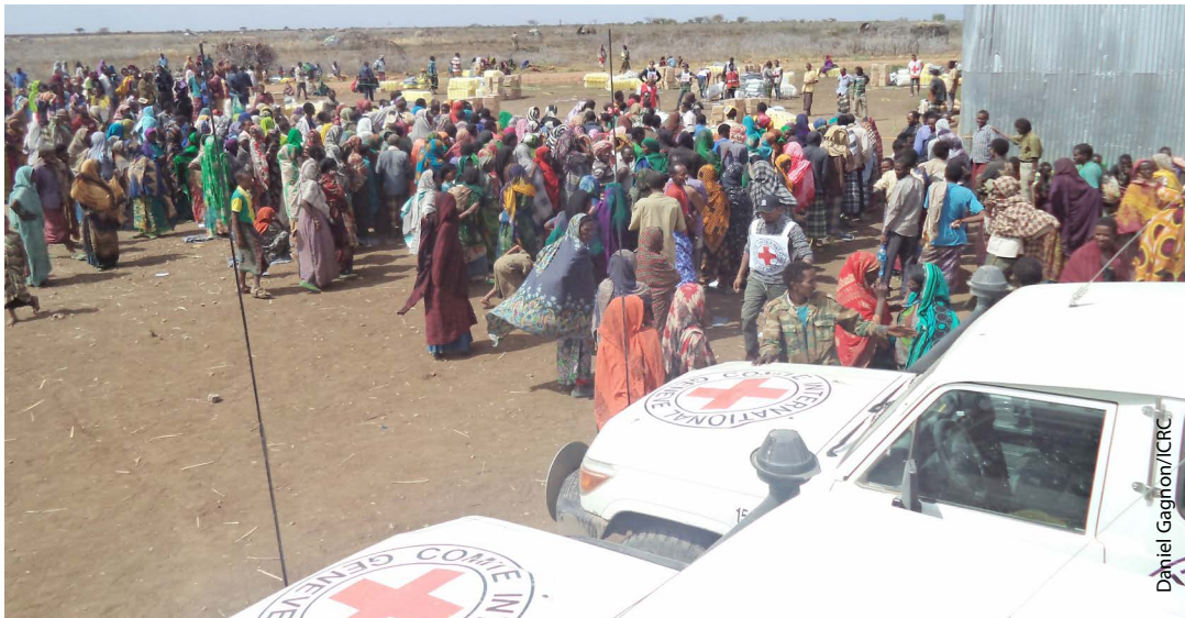
The ICRC and ERCS jointly distribute seeds and farming tools to drought affected communities in Hawigudina locality of West Hararge Zone, Oromia Region, 2016