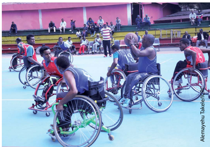
Persons with physical disabilities competing at the first national wheelchair tournament organized jointly by the ICRC and the Ethiopian Basketball Federation, Addis Ababa, 2016.

The ICRC Physical Rehabilitation Program works to promote equal access to quality and long-term sustainable rehabilitation services to Persons with Physical Disabilities (PWDs) through support to national and regional actors. Access to such physical rehabilitation services enables PWDs to recover mobility, play an active role in society and live in dignity.