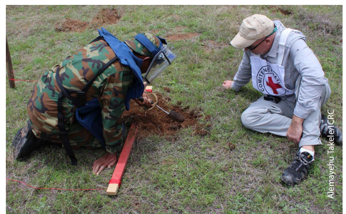
A deminer exercising skills he acquired during a humanitarian training organized by the ICRC and ENDF, Entoto, Addis Ababa, 2016.