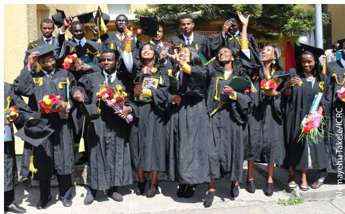
Orthopedic technicians graduates celebrate their graduation after completing a three-year training course run by the ICRC and five governmental institutions, Addis Ababa, 2016.