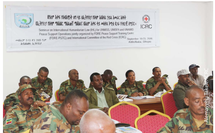
A seminar organized for military officers to be deployed as UN peacekeeping mission, Addis Ababa, 2016.