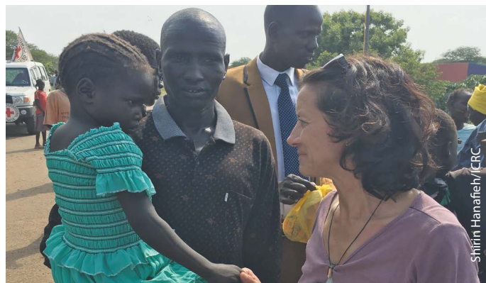
A five-year old girl reunited with her father after eight months of separation through the help of the ICRC, Pagak entry point, Gambella Region, 2016.

The ICRC, in cooperation with the ERCS, strives to restore family links between family members separated by conflict and violence through the provision of free phone calls and the exchange of Red Cross Messages.