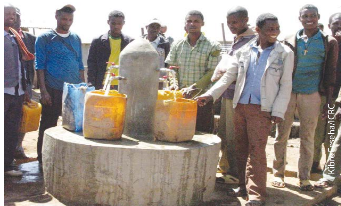
A water facility built for Ejere regional prison by the ICRC to improve access to drinking water for prisoners, Oromia Region, 2016.

The ICRC works with the local authorities and communities to improve access to clean water and sanitation services.