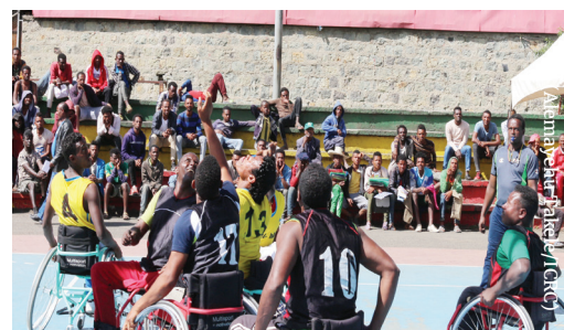
People with disabilities competing at 4 th National Wheelchair Basketball Tournament at the Addis Ababa Mini-Stadium, 2018.

The ICRC Physical Rehabilitation Program works to promote equal access to quality and long-term sustainable rehabilitation services to Persons with Physical Disabilities (PWDs) through support to national and regional actors to enable them recover mobility, play an active role in society and live in dignity.