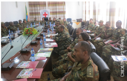
Defense force officers receive training organized jointly by the ICRC and ENDF on the basics of the International Humanitarian Law, Addis Ababa, 2018.

The ICRC promotes the knowledge of International Humanitarian Law (IHL) amongst various interlocutors such as military and police forces, national authorities, and academic circles and supports efforts to integrate/ domesticate IHL.