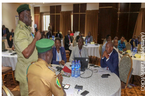
Prison managers from six African Anglophone countries sharing best practices related to improvement of prison infrastructure, Addis Ababa, 2018.