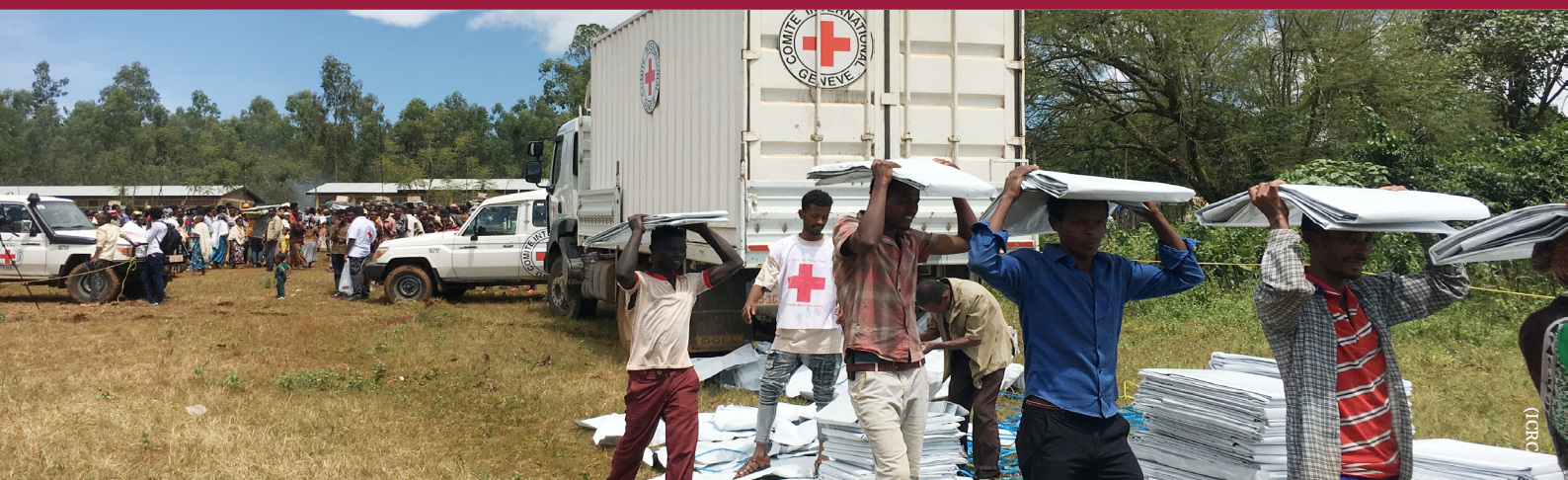
People displaced by ethnic violence in Kiltu Kara district, West Wellega Zone of Oromia Region, receive non-food items from ICRC and ERCS, 2018.