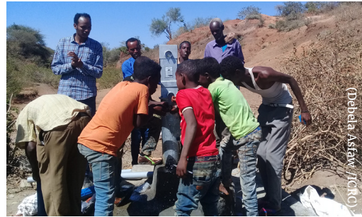
A water point built in Babile, East Hararge Zone for people affected by ethnic violence, 2018.

The ICRC works with local authorities and communities to improve access to clean water and sanitation services.