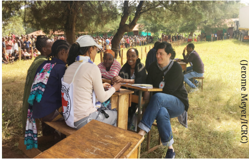
ICRC staff talking with people displaced by ethnic violence in Kochere district, Gedeo Zone of Southern Ethiopia Region on the kind of support they need, 2018

The ICRC, in cooperation with the ERCS, strives to restore family links between family members separated by conflict, violence and migration through the tracing services of the Red Cross and Red Crescent Movement as well as through the provision of free phone calls and the exchange of Red Cross Messages (RCMs).