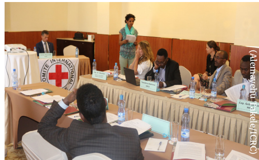
Representatives from government authorities, academia and the UN participate at a seminar on the Arms Trade Treaty, Addis Ababa, 2018.