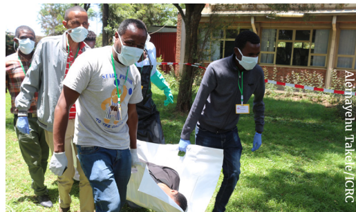
Red Cross volunteers transporting a causality from a fatality scene during a simulation exercise at a training on dead body management provided by ICRC and ERCS, Addis Ababa, 2019.