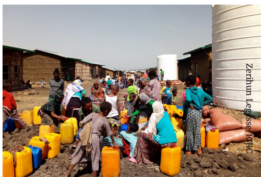
People affected by ethnic conflict fetching water from a water tanker supplied by ICRC, Iyemba, West Gondar Zone, Amhara Region, 2019.

The ICRC works with local authorities and communities to improve access to clean water and sanitation services.