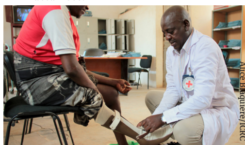
An ICRC staff fitting orthotic device for a detainee with physical disability at a prison in Dire Dawa, 2019.