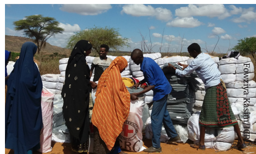
The ICRC and ERCS jointly distribute essential household items to people displaced by ethnic violence in Babile district, Fafan Zone of Somali Region, 2019.