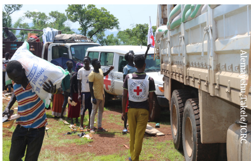
People affected by ethnic violence receive seeds and farming tools distributed by ICRC and ERCS, Yaso district, Benishangul-Gumuz Region, 2019.