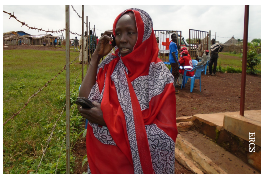
A South Sudanese refugee calling her family from a refugee camp in Assosa, Ethiopia, 2019.

The ICRC, in cooperation with the ERCS, strives to restore family links between family members separated by conflict, violence and migration through the tracing services of the Red Cross and Red Crescent Movement as well as through the provision of free phone calls and the exchange of Red Cross Messages (RCMs).