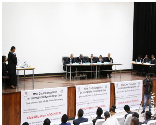
Finalists of the 4th National IHL (International Humanitarian Law) Moot Court Competition presenting their arguments before a panel of judges, Wollo University, Dessie Town, Amhara Region, 2019.