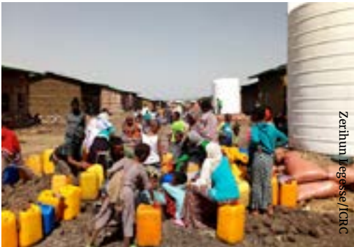
People affected by ethnic conflict fetching water from a water tanker supplied by ICRC, Iyemba, West Gondar Zone, Amhara Region, 2019.

The ICRC works with local authorities and communities to improve access to clean water and sanitation services.