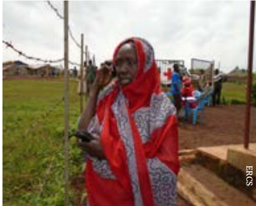
A South Sudanese refugee calling her family from a refugee camp in Assosa, Ethiopia, 2019.

The ICRC, in cooperation with the ERCS, strives to restore family links between family members separated by conflict, violence and migration through the tracing services of the Red Cross and Red Crescent Movement as well as through the provision of free phone calls and the exchange of Red Cross Messages (RCMs).