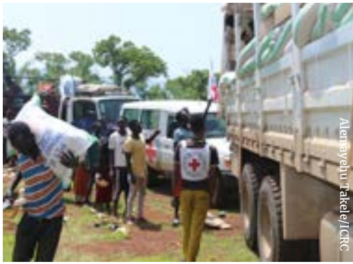
People affected by ethnic violence receive seeds and farming tools distributed by ICRC and ERCS, Yaso district, Benishangul-Gumuz Region, 2019.