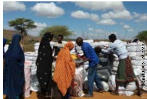
The ICRC and ERCS jointly distribute essential household items to people displaced by ethnic violence in Babile district, Fafan Zone of Somali Region, 2019.

The ICRC and the ERCS jointly provide support to people affected by inter-communal clashes and ethnic violence in different regions of the country.