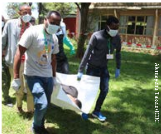
Red Cross volunteers transporting a causality from a fatality scene during a simulation exercise at a training on dead body management provided by ICRC and ERCS, Addis Ababa, 2019.

The ICRC works with local authorities to ensure that civilian residents, wounded and sick receive timely pre-hospital and hospital care during emergency in catchment area of ICRC-supported health facilities through provision of medical assistance.