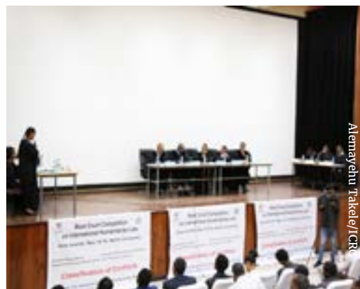
Finalists of the 4th National IHL (International Humanitarian Law) Moot Court Competition presenting their arguments before a panel of judges, Wollo University, Dessie Town, Amhara Region, 2019.