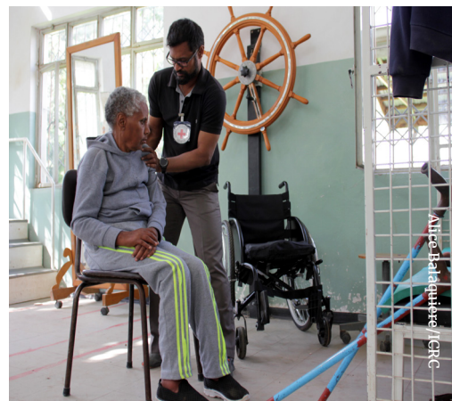
An ICRC staff assessing level of disability of a stroke patient at Assella Physical Rehabilitation Center, 2018.

The ICRC Physical Rehabilitation Program works to promote equal access to quality and long-term sustainable rehabilitation services to Persons with Physical Disabilities (PWDs) through support to national and regional actors to enable them recover mobility, play an active role in society and live in dignity.