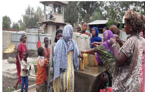
Prisoners fetching water from a water point built in Adele prison in East Hararge Zone, Oromia region, 2018

The ICRC works with local authorities and communities to improve access to clean water and sanitation services.