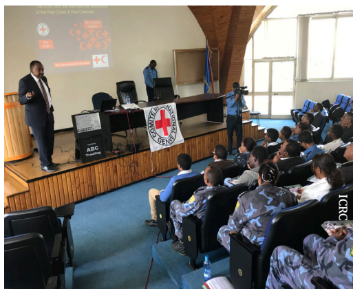
Senior federal police officers trained in international human rights standards and humanitarian principles, Addis Ababa, 2018.