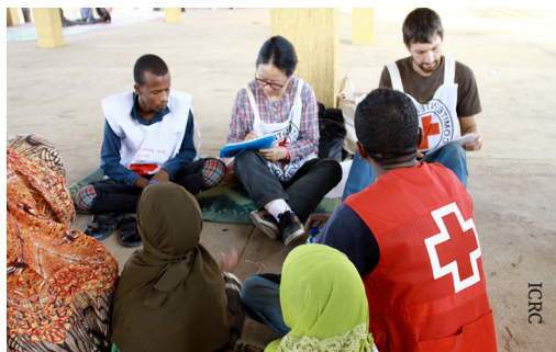
ICRC staff collect tracing request from people displaced by violence looking for their missing family members, 2018.

The ICRC, in cooperation with the ERCS, strives to restore family links between family members separated by conflict, violence and migration through the tracing services of the Red Cross and Red Crescent Movement as well as through the provision of free phone calls and the exchange of Red Cross Messages (RCMs).