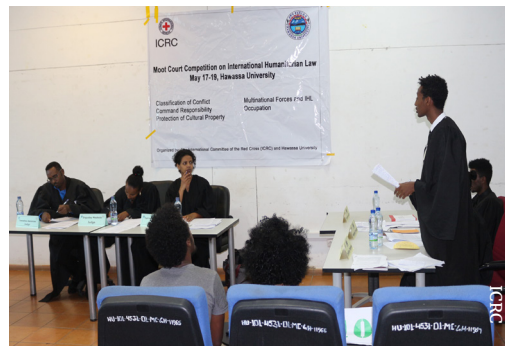
Competitors presenting their arguments at 3rd National Moot Court Competition organized in partnership with Hawassa University, 2018.