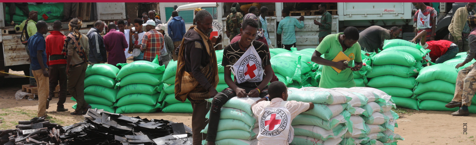
People displaced by ethnic violence in Darolebu in West Hararge Zone, Oromia Region, receive seeds and farming tools from ICRC and ERCS, 2018.