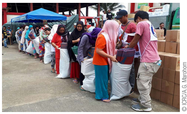
Distribution of household items in Bubong, Lanao del Sur

Continued providing medical supplies where needed for assisting wounded or displaced people, focusing more recently on the less-accessible municipalities of Tamparan, Ditsaan-Ramain and Bubong. Since the beginning of the crisis, more than 13 local health facilities have received support from ICRC