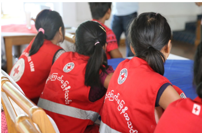
MRCS volunteers are briefed on livelihood restoration activities in Mrauk-U, Rakhine State.

In Rakhine State in the days following the floods the MRCS and ICRC distributed rice, household items and/or shelter kits to more than 25,000 people. In September they distributed food, household items or an equivalent in cash to 60,000 people in Mrauk-U, Kyauktaw and Minbya and provided health education sessions for communities. They also worked to ensure access to safe drinking water and to clean contaminated ponds, cleaning 36 for the benefit of over 40,000 people.