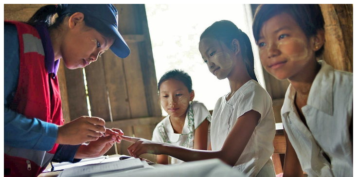
An MRC volunteer teaches schoolgirls in Kale, Sagaing Region how to wash hands and cut nails to ensure good hygiene.

Twelve of the country's 14 States and Regions were affected, with Hakha in Chin State, Kale in Sagaing Region, Pwintbyu in Magway Region and Minbya and Mrauk-U in Rakhine State identified as the five most affected townships by the National Disaster Management Committee (NDMC). Mobilising more than 1,400 staff and volunteers in the 12 affected States/Regions, the Myanmar Red Cross Society (MRCs) – with the support of the International Federation of the Red Cross and Red Crescent Societies (IFRC) and the International Committee of the Red Cross (ICRC) – assisted the evacuation of more than 380,000 people from flood areas and provided first aid, relief supplies and clean water during the emergency phase.