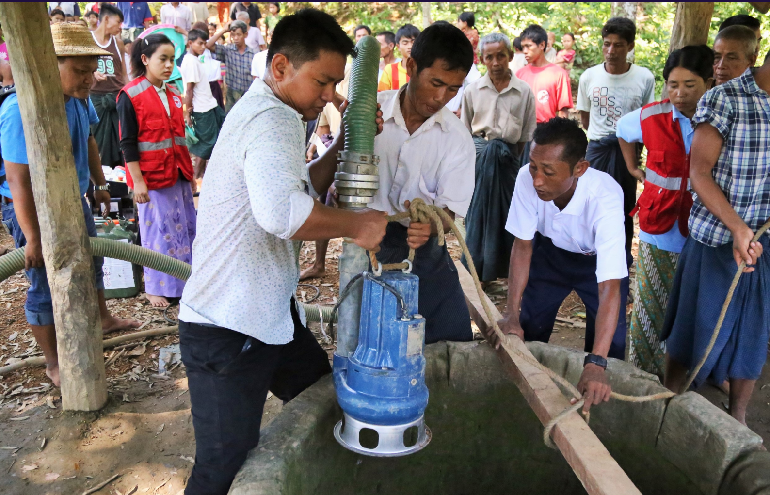
MRCs and ICRC staff lower a pump into a well in a flood-affected village in Rakhine State. Ensuring communities have access to clean water has been a priority for the Movement since the first days of the crisis.