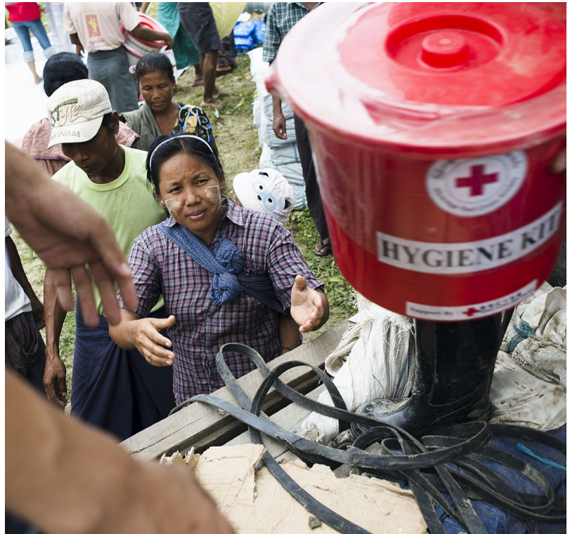
MRCS volunteers distribute vital supplies to people from a flooded community in Kale, Sagaing Region.

On August 11 the IFRC launched an emergency appeal for 4 million Swiss francs (4.1 million USD) to allow the MRCS to support some 58,000 people over the subsequent 12 months. The appeal was later revised to 3.28 million Swiss francs and is now 96% covered. The operation, to be managed from a new MRCS hub office in Kale Township, Sagaing Region, will channel support to communities in the worst-affected areas of Sagaing Region and Chin State. This will mainly focus on the provision of unconditional cash grants allowing affected people to choose how they meet their recovery needs. The appeal will also provide water and sanitation, health and livelihood support as well as helping communities to be better prepared for future disasters.