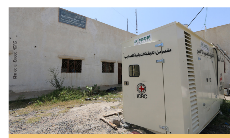
A generator donated to the Water Corporation in Taiz.

■ In Bajel City, the ICRC stabilized the wastewater treatment plant by removing dried sludge from the overflowing stabilization pond. The ICRC cleaned garbage in cooperation with the Bajel Cleaning Fund. Production