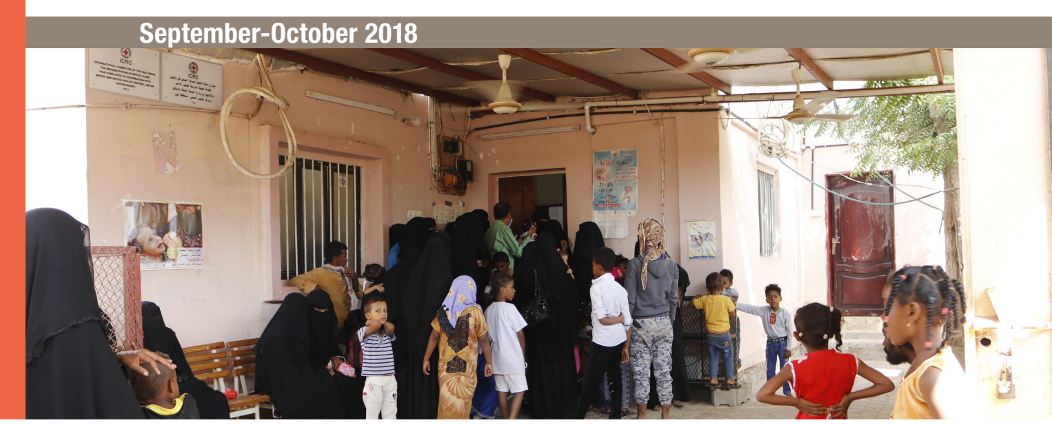
Patients wait for their turn at the ICRC-supported Bateis primary healthcare center in Abyan governorate.

In September and October, the International Committee of the Red Cross (ICRC) gradually resumed its regular pace of activities across Yemen: relief work but also support to healthcare facilities and water corporations. The situation in the country is desperate and we are advocating for a political solution to put an end to the immense humanitarian suffering and allow aid to reach all those in need.