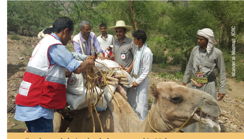
Food parcels being loaded on a camel in Mahweet.