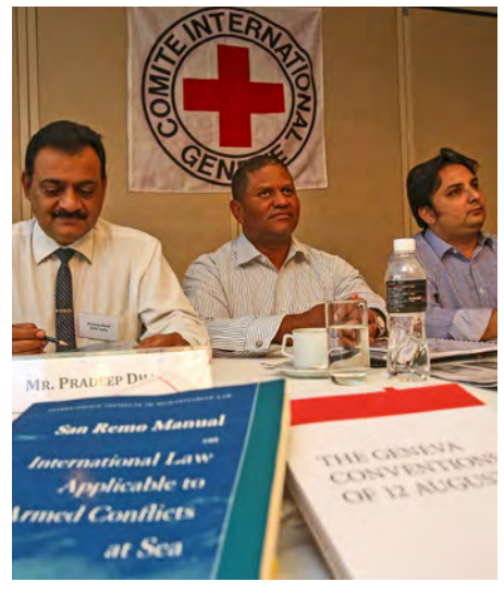
High-ranking officers from 15 Asia-Pacific countries attended the regional seminar on the law of armed conflict at sea in Thailand

Where possible, the ICRC makes similar approaches to other weapon bearers, in particular armed groups fighting the authorities.