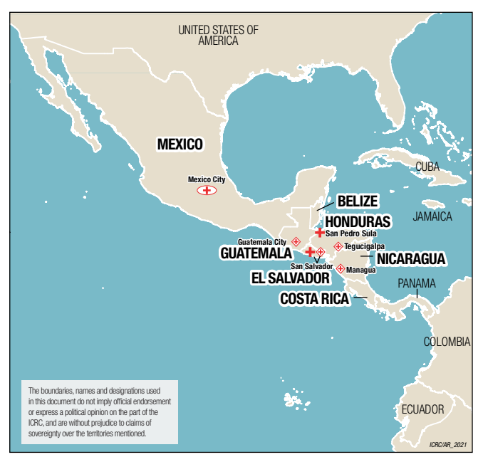
ICRC regional delegation H ICRC mission H ICRC office/presence