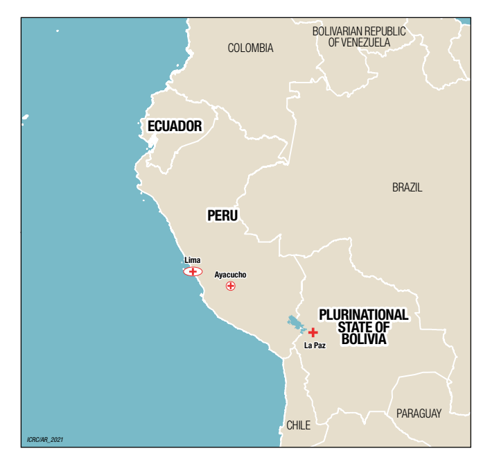
(+) ICRC regional delegation (+) ICRC sub-delegation (+) ICRC office/presence