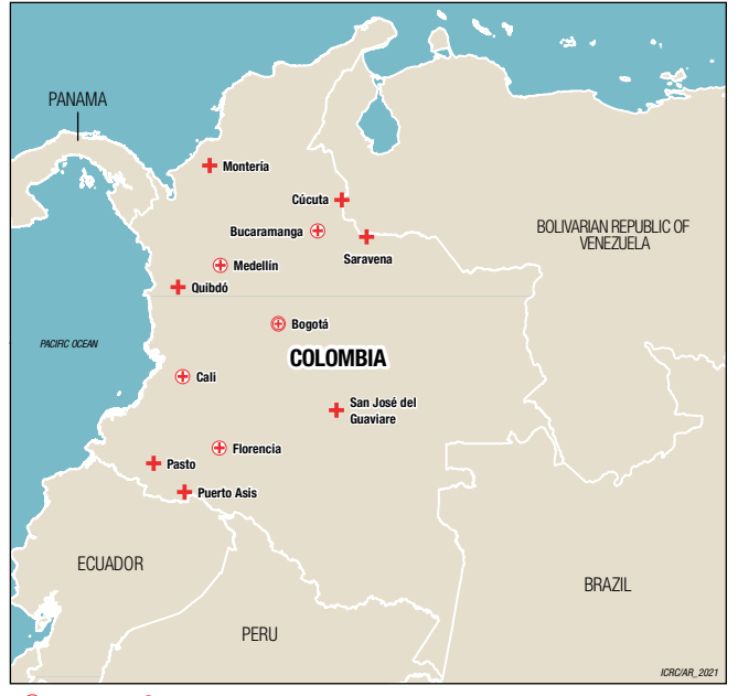
ICRC delegation H ICRC sub-delegation ICRC office/presence