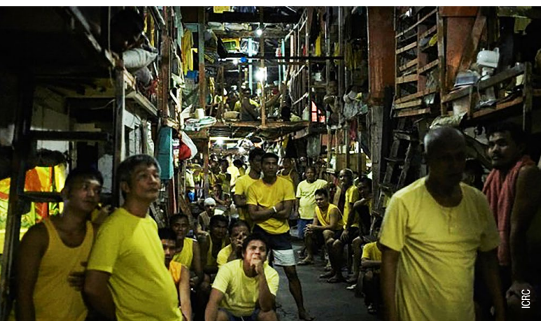
Philippines. Overcrowding in the country's jails has been a problem for many years.

As part of its response to COVID-19, the ICRC is working with the relevant authorities to strengthen standard practices (e.g. medical screening of new arrivals and the setting up of prevention measures, such as handwashing stations) for detainees, visitors, guards and other people. It is providing prison clinics with medicines and other supplies, and training staff in addressing detainees' health-care needs. It is also working with authorities to make sure that detainees have access to timely medical