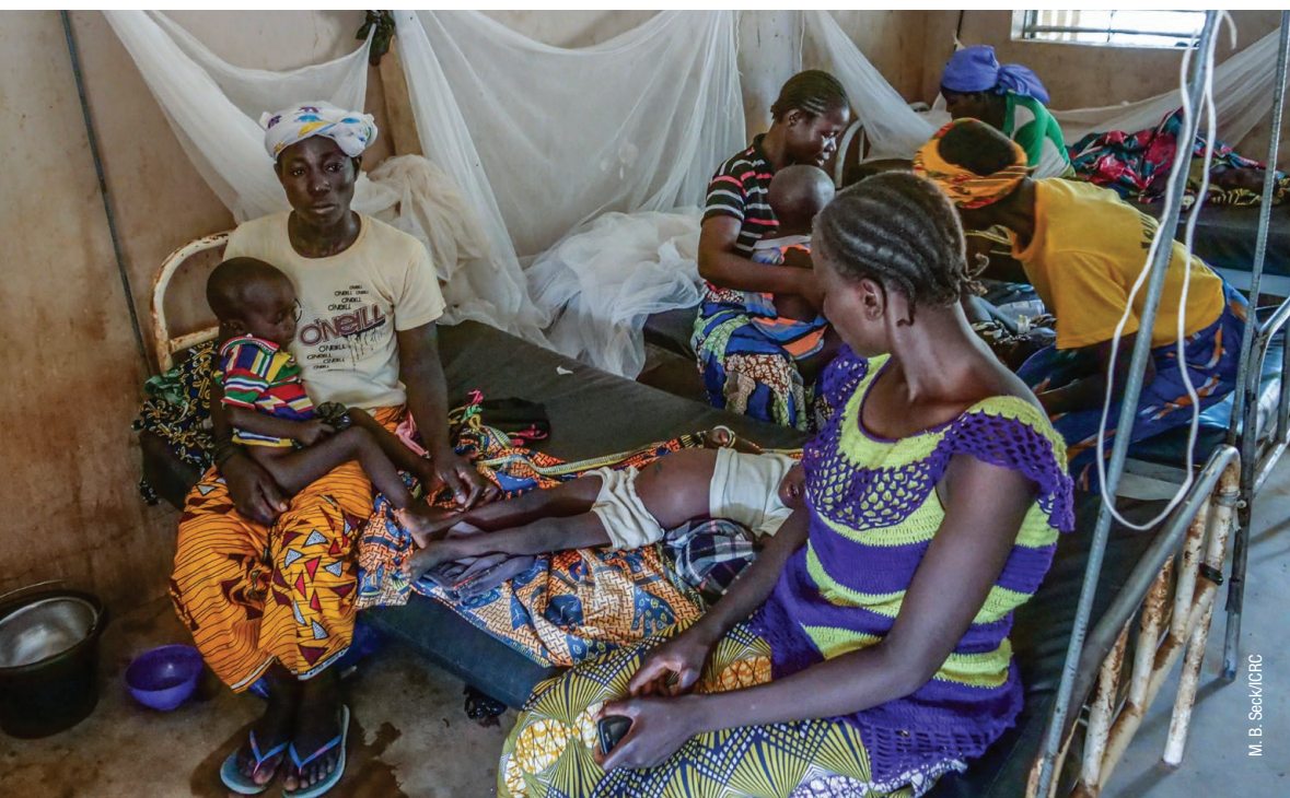
Burkina Faso. After the closure of several health centres in the province, the Barsalogho medical centre is receiving three times as many patients today as in 2018. There are not sufficient beds and some patients are receiving care or sleeping outside.