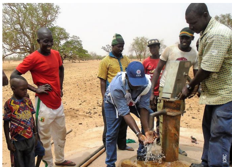
Mali. The ICRC facilitates access to water for people in conflict-affected areas.