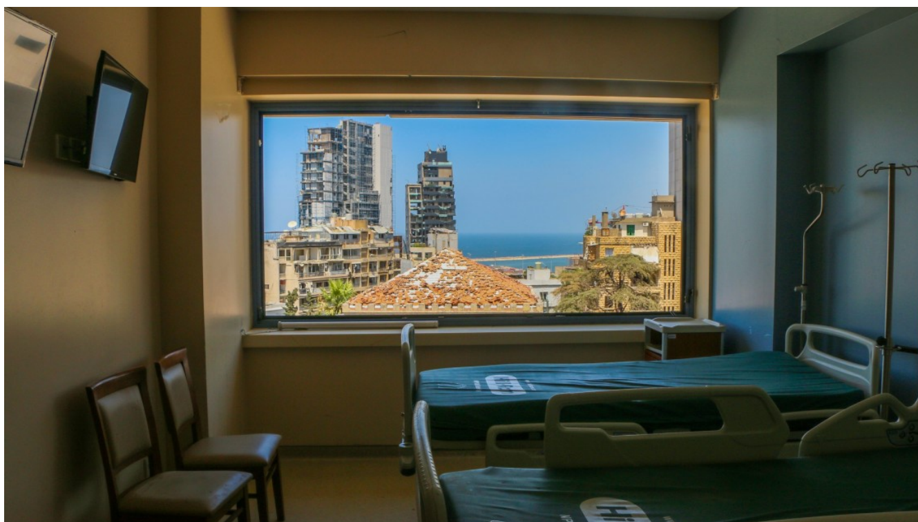
Lebanon. Photo of a hospital. The damage can be seen through the window.

The continuous prevalence of the pandemic, made us continue to raise awareness on COVID-19 in addition to providing medical supplies to Rafik Hariri University Hospital, with which the ICRC has partnered since 2016 to support access to quality healthcare for the most vulnerable.