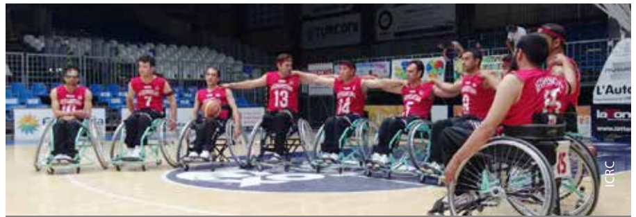
The Afghanistan Wheelchair Basketball team gathers together before the start of the match

The national basketball team, which was created in 2013 under the aegis of the Afghanistan Paralympic Committee, had been invited by Briantea84 of Cantù near