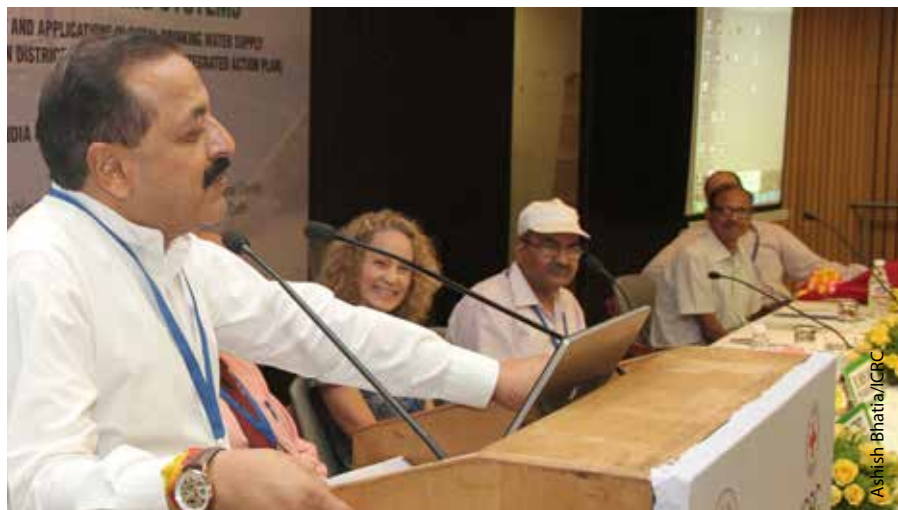
India's Minister of State for Science and Technology Dr Jitendra Singh speaking at the inaugural session

The workshop was being attended by senior retired government officials, representatives from state governments, subject experts, research agencies and manufacturing companies who highlighted different