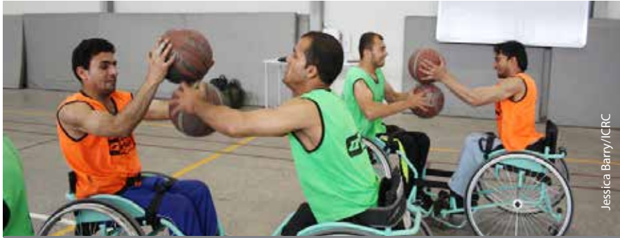
The Afghan players at a basketball practice session at the ICRC Orthopaedic Centre, Kabul

The month of May 2014, was a benchmark in the lives of a handful of young men from Afghanistan who comprise the national wheelchair basketball team. These men — who have been affected physically by disease, disaster or conflict and have been rehabilitated by the ICRC — had gone to Italy at the invitation of Italian sports club Briantea84 to play in a series of matches between 22-29 May.