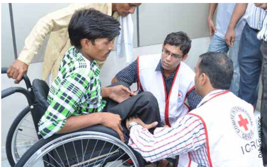
The ICRC in cooperation with the Centre for Empowerment and Initiatives provided wheelchairs to persons with disabilities in Noida (UP) in Noida (UP)