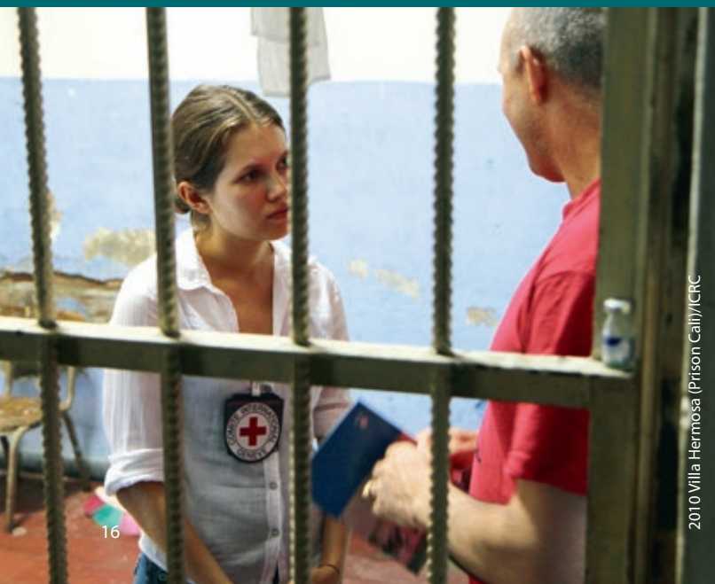
2010 Villa Hermosa (Prison Cali)

Whatever the format, visiting agreements must always grant the direct access to detainees in their place of detention, in accordance with the terms and conditions described above.