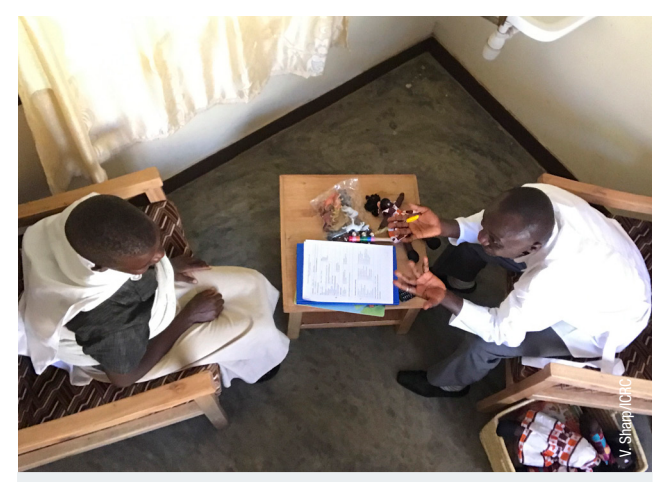
Burundi, Bujumbura. The ICRC supports victims of violence, including sexual violence.