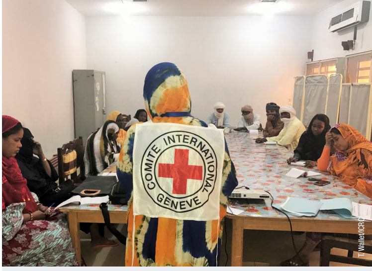
Mali, Kidal. With the help of community relays, the ICRC organizes an information session on sexual violence and its consequences.