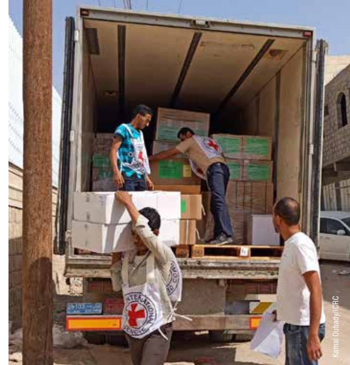
ICRC staff members deliver one of the surgical and medical supplies shipments the ICRC donated to a number of hospitals in Marib.