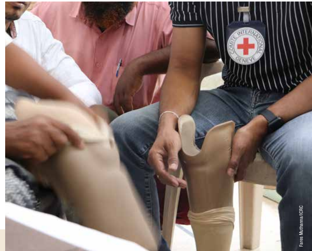
A specialist at the ICRC-supported physical rehabilitation center in Mukalla takes measurements to make a prosthetic limb for a beneficiary who lost a leg.

including 1,515 prostheses, 35,587 orthoses, 4,357 walking aids, and 192 wheelchairs were produced in the 5 ICRC-supported PRCs in 5 governorates.