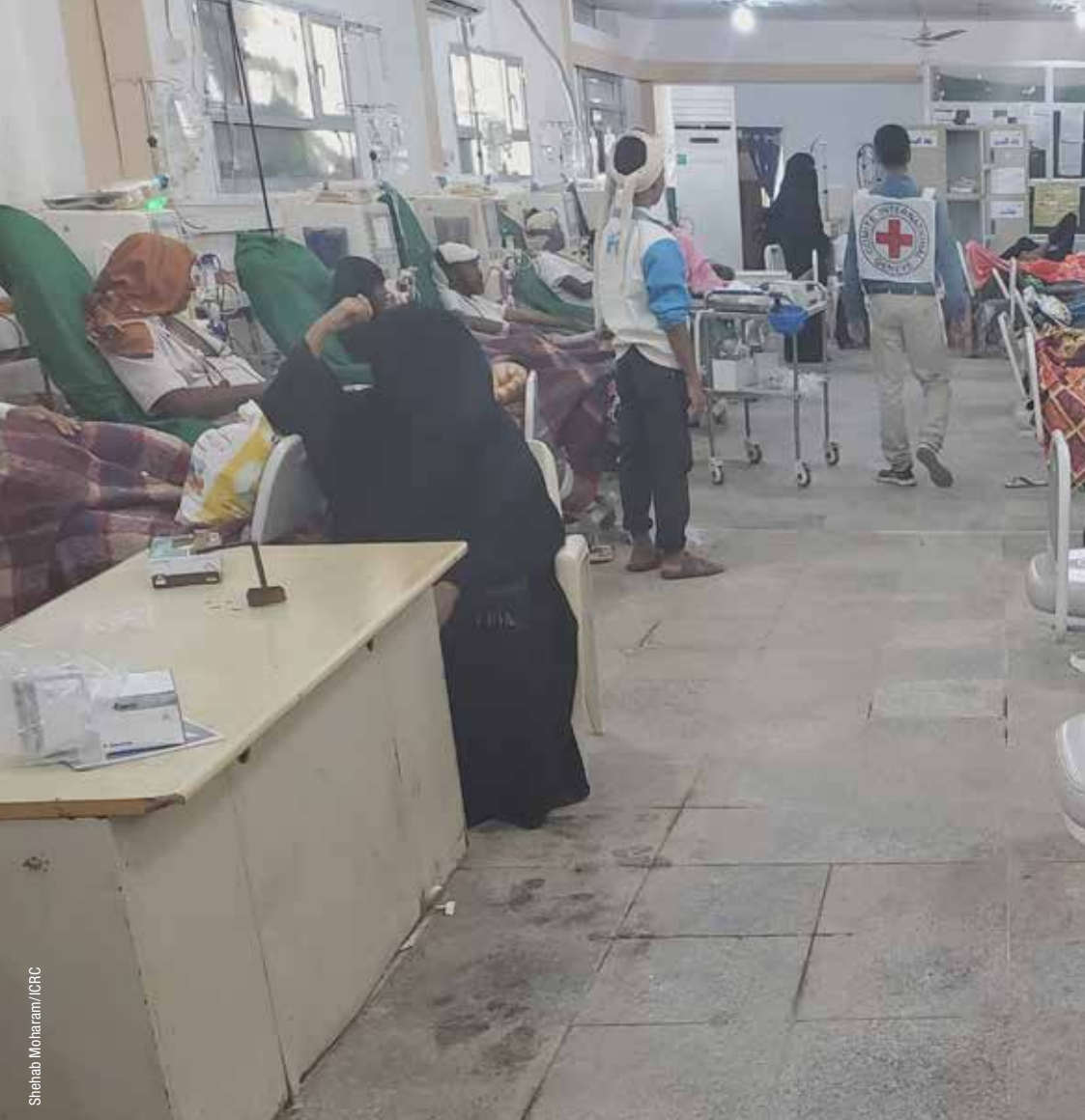
An ICRC staff member checks on the dialysis center in Hodeidah the ICRC supports with medical supplies.