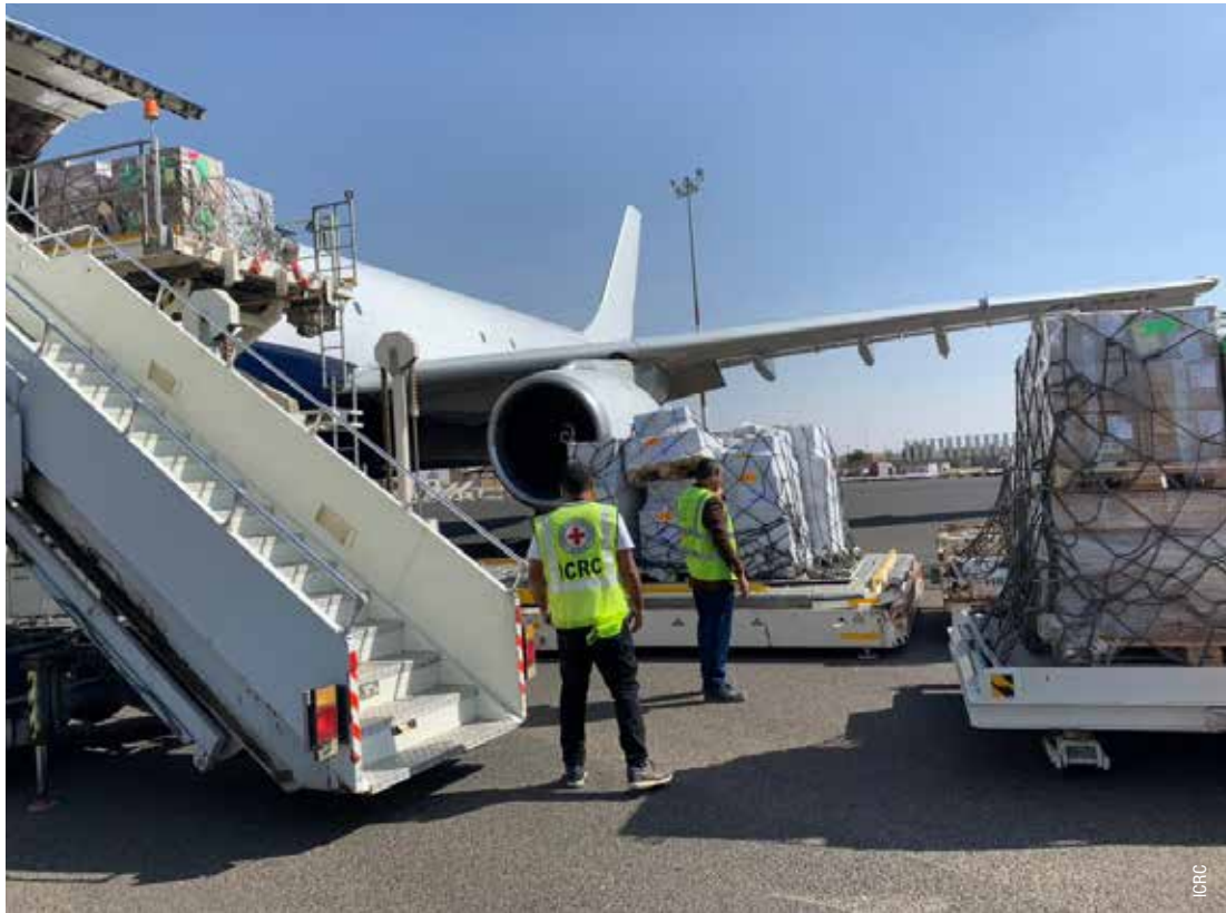
An ICRC medical shipment brought to the country by air.

were performed in all hospitals supported by the ICRC.