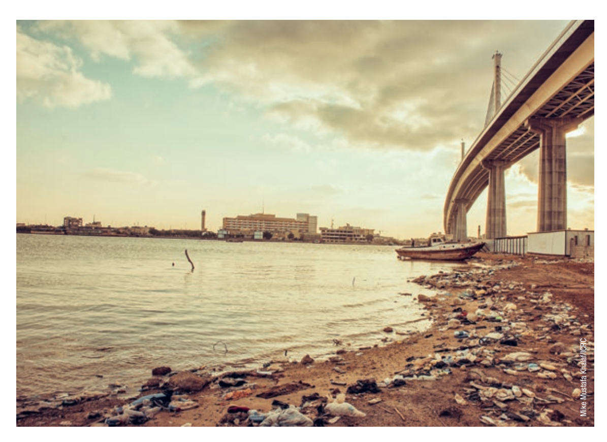
In southern Iraq, the quality of available water is poor, with high levels of salt and contamination from sewage and agriculture.

Institutional challenges to planning and coordinating adequate responses are many, ranging from insecurity, weak institutions, aging infrastructure, and a mindset that encourages consumption rather than environmental preservation. The country's economic reliance on oil exploitation also makes it hard for the society to grasp and embrace the profound implications of a shift towards renewable energies at a national and global level. Obstacles to a comprehensive response to climate and environmental risks include limited technical expertise insufficient knowledge of climate risks and their consequences at the local level, lack of authoritative data on water quantity and quality, lack of capacity, or unwillingness, to implement existing laws, and inadequate investment in the water sector. Prolonged instability has also impaired Iraq's capacity to engage in regional water cooperation and diplomacy with Iran and Turkey, and with Kurdish authorities.