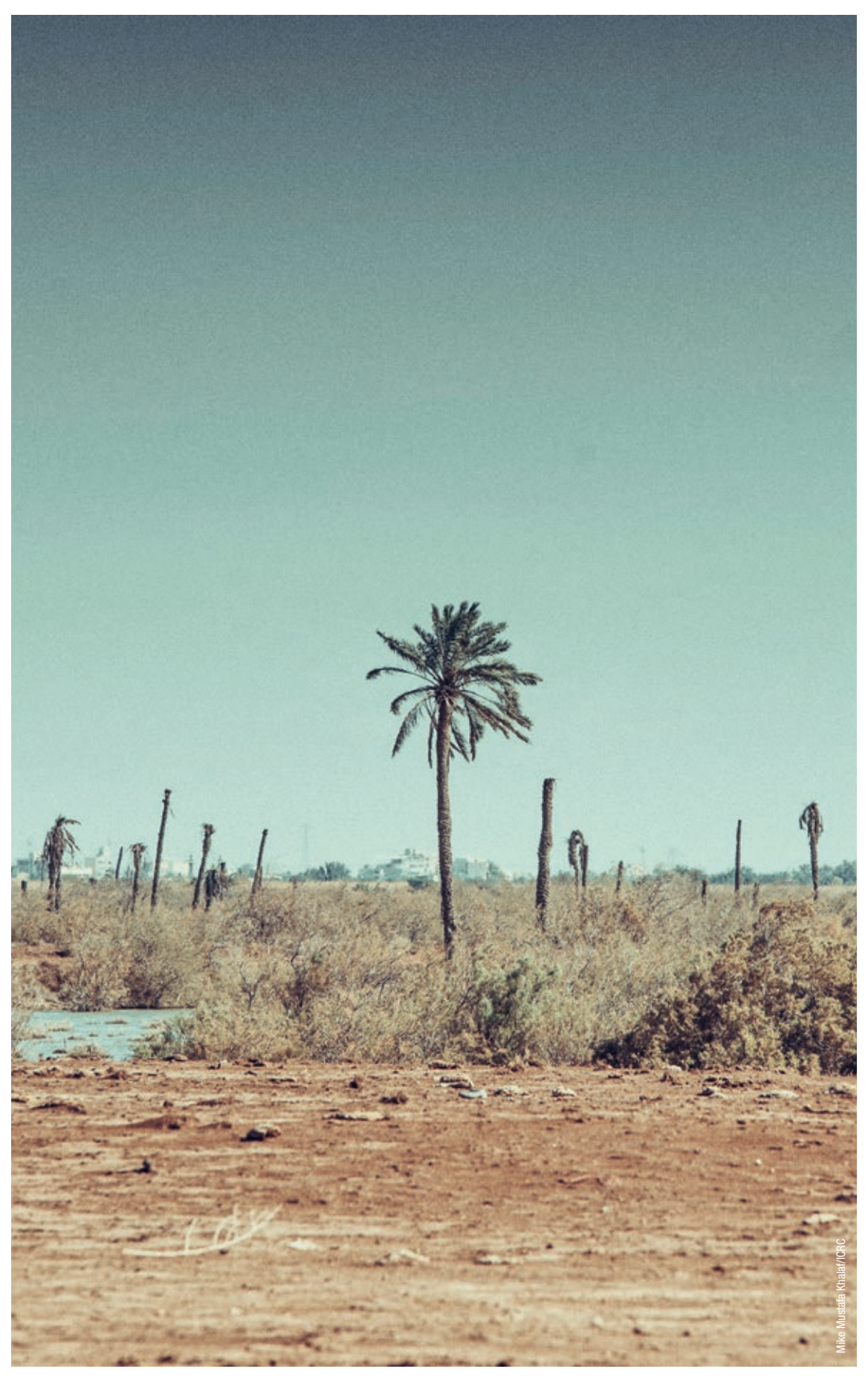
In Fao, palm trees damaged during the Iran-Iraq war in the 1980s have not grown back.