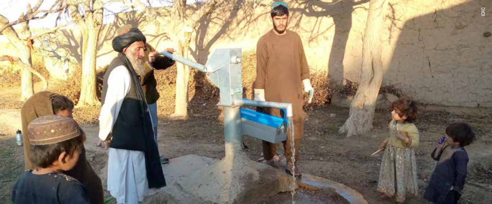
Communities gain access to safe drinking water through hand pumps repaired by the ICRC.