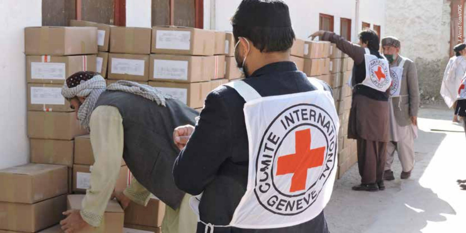
Winter items (such as blankets) and hygiene products being distributed for detainees at Sarpoza Provincial Prison.