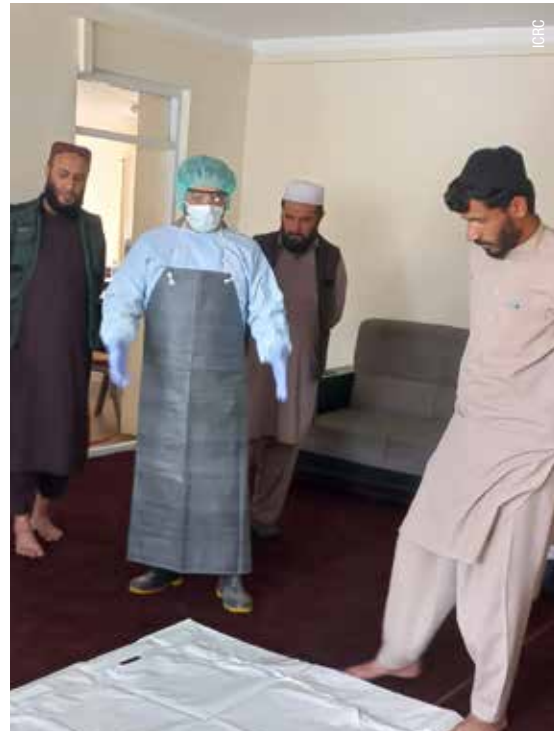
An ICRC specialist trains ARCS staff and volunteers as part of the Human Remains Transfer Programme.

rounds of donations of PPE items, body bags, disinfectants and office consumables to ARCS and to 27 forensic medicine departments across the country