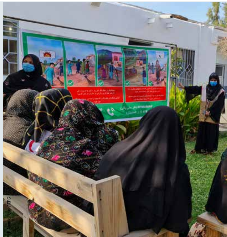
Mine risk awareness training being held for ARCS volunteers to spread awareness in the communities.

1 Risk Awareness and Safer Behaviour project launched with the ARCS in north, south and east regions. 60 volunteers identified to raise awareness in the most affected districts of those regions