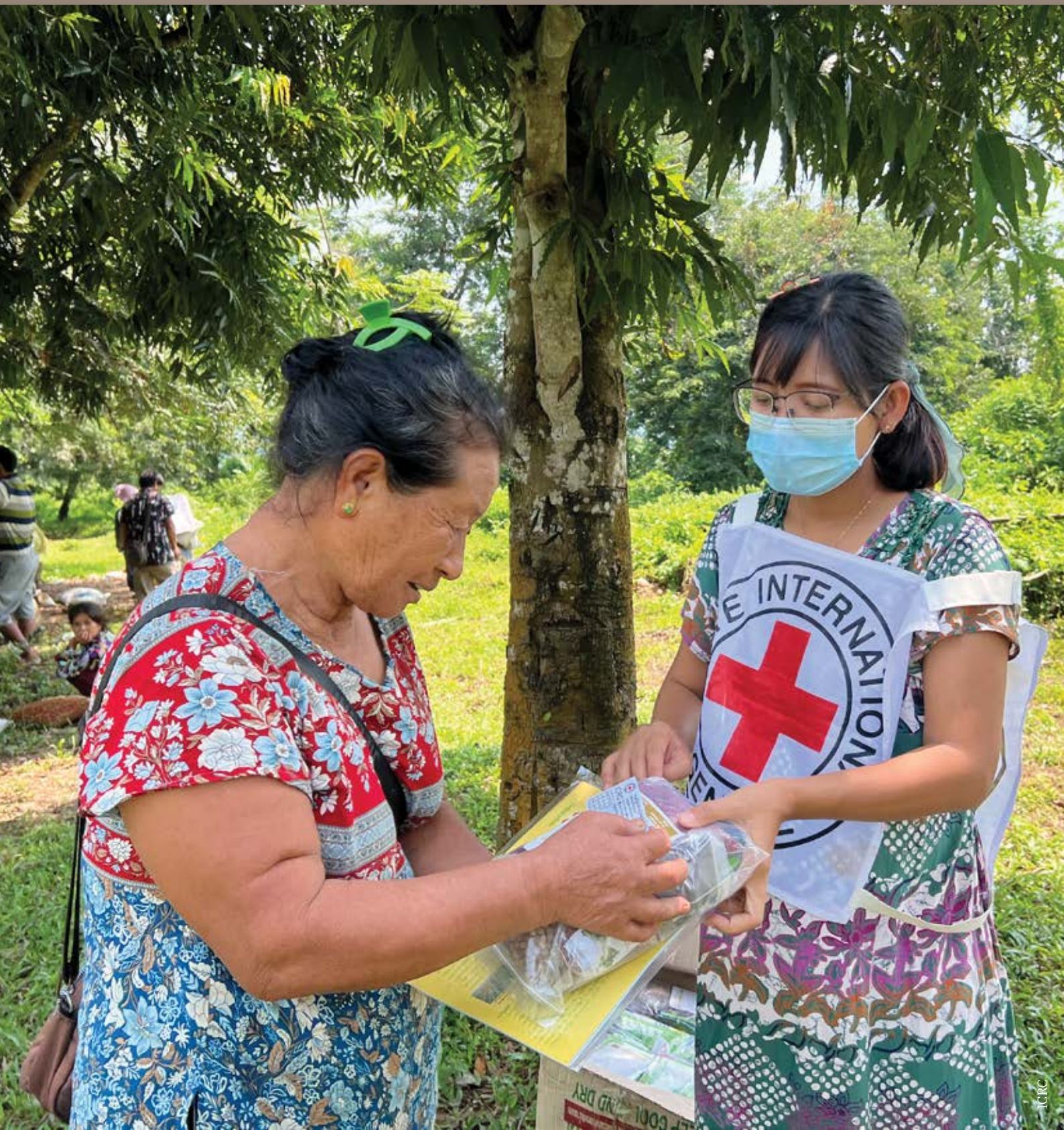
A lady living in Kachin State is receiving various kinds of seeds to cultivate in winter season.