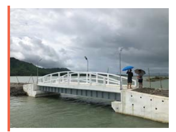
3 new bridges in Pauktaw Township eased daily commutes for some 13,000 people.